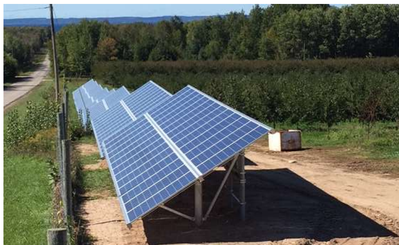
Figure 1 - Photograph of the solar arrays positioned between the main road and cherry orchards.

Following approval by the owners of King Orchards, Harvest Energy moved forward with the project implementation, completing all the paperwork and contract labor requirements. Since the existing electrical service was old and deteriorating, an electrician was brought in to upgrade it to a new, clean service so the project could proceed. King Orchards worked with Great Lakes Energy Electric Cooperative with regards to interconnectivity of their solar energy system and reported no issues from the utility perspective. Little involvement was required of the owners during the installation process, which began on September 14, 2015, and was completed by September 25, 2015. The solar arrays were positioned along a main road on the property (Figure 1), and though some land was excavated to prepare the ground for the arrays, the owners were able to easily work around the installation while in progress. The solar energy system was operational only 6 weeks after Harvest Energy's initial proposal, when the Michigan Farm Energy Grant had been awarded. The owners were very pleased with the contractor, especially with the recommendations and overall ease of the process. They emphasize that the background research and planning brought by Harvest Energy Solutions was critical in their decision making process.